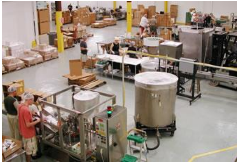
Our current state-of-the-art manufacturing facility.

It was then we decided to market the cream and make it generally available. It's now made in our state of the art manufacturing facility in Florida. We believe in Premier and stand by the value of our product so much, that we offer a 30 day, 100% money back guarantee if the cream does not work. Just return the unused portion and we will refund your money.